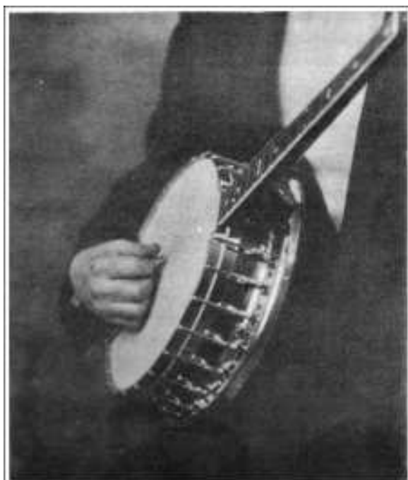
No 2. Side View.