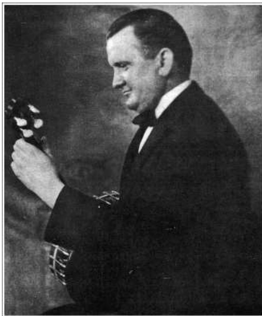
Illustration No. 3_Showing Position of the Left Hand_