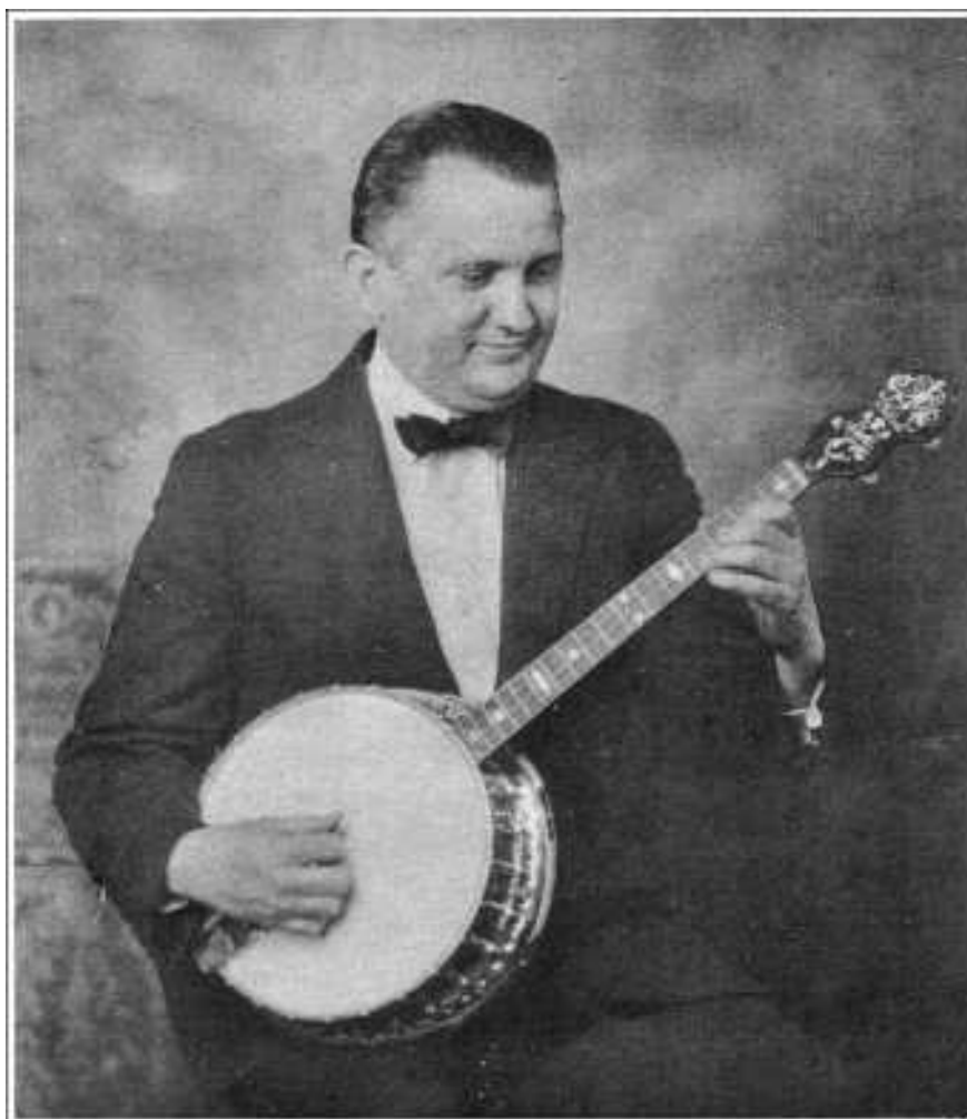
No 1. Front View.